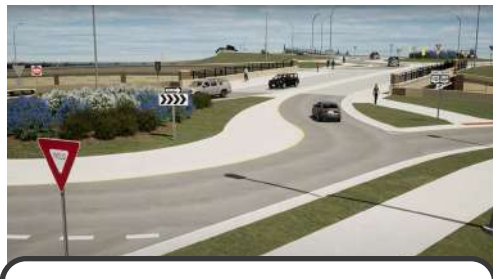
Roundabout center median landscaping details