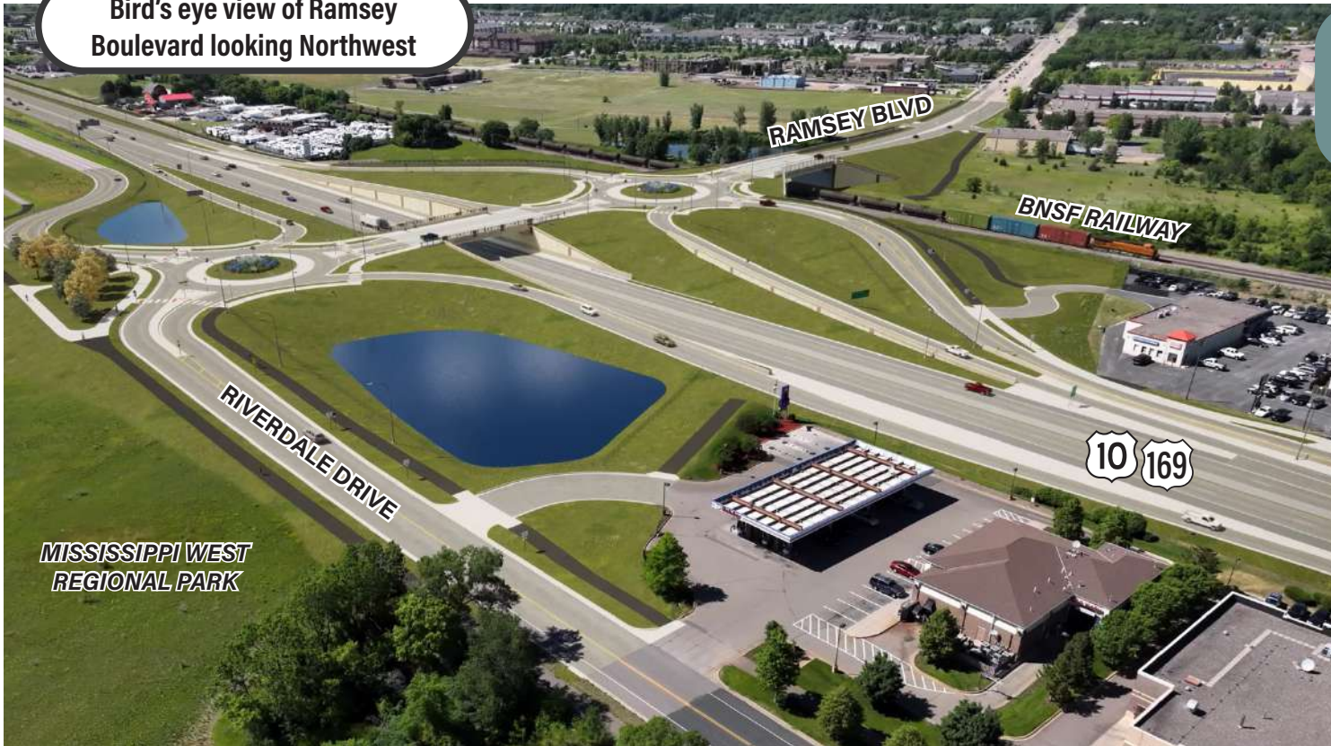
Bird's eye view of Ramsey Boulevard looking Northwest

Check out the final design fly-through video on the project website!