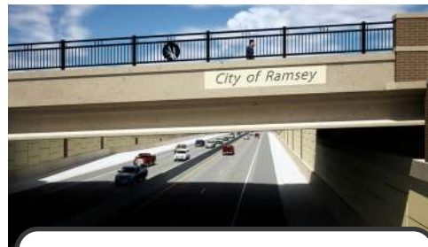
Bridge over Hwy 10 / 169 design details