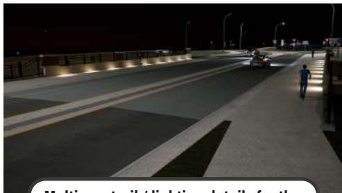
Multi-use trail / lighting details for the Ramsey Blvd bridge